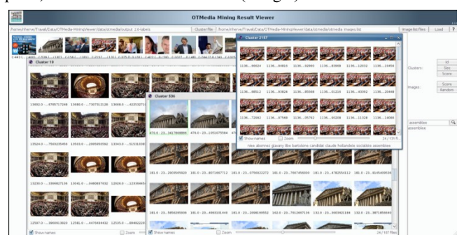
Fig2: Search on "National Assembly" gathers visual clusters illustrating articles on laws and deputy work

Copy and plagiarism detection are computed to study not only citation propagation but also how much AFP provides news to the press, television and radio stations (cf fig 4).