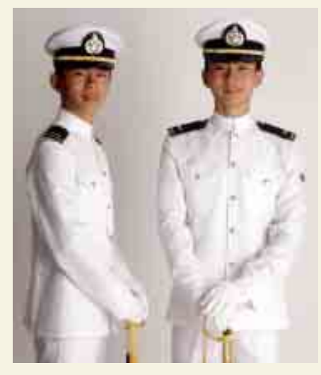
An inspiration to each other, both graduated with Diplomas with Merit. They are also the first two polytechnic graduates to receive overseas scholarships from the Republic of Singapore Navy.

Let (us) talk about our pre-NP days. We didn't do well for our PSLE. Despite being hardworking, we still didn't do well in secondary school and failing 4 to 5 subjects was common. I can still remember very clearly that I was the second last in the whole cohort, while my brother did better than I. Guess what...he was third from last.